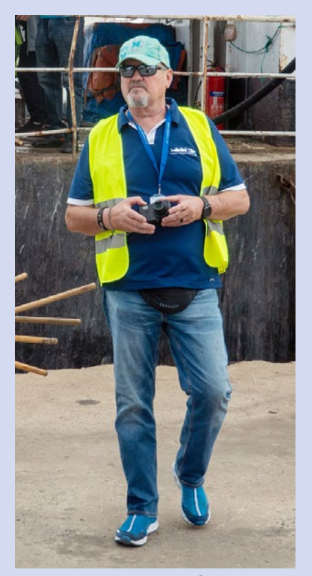
JD in Luanda doing real life inspections of fishing vehicles as part of the training