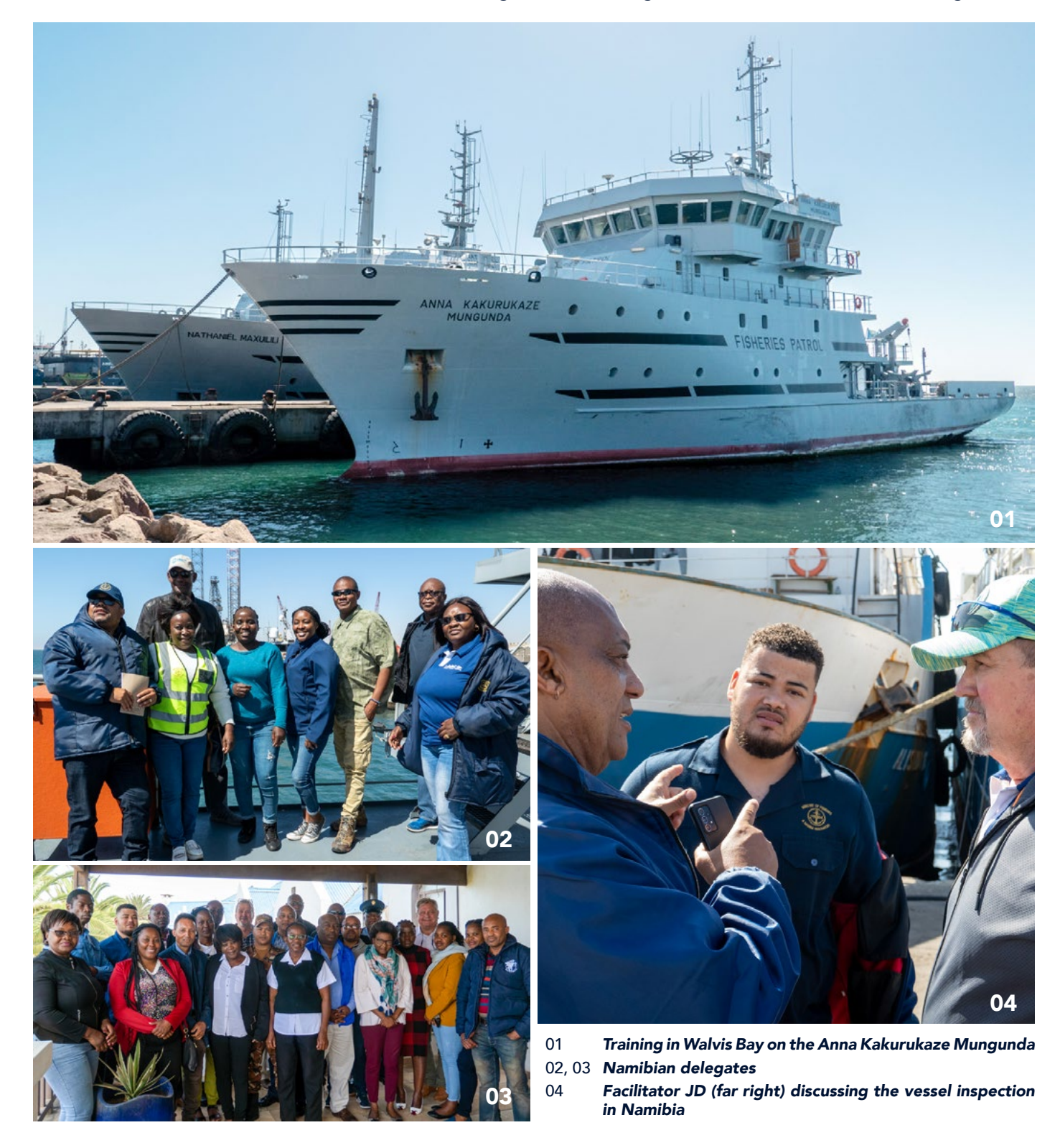
12 delegates (for managers) from the abovementioned agencies