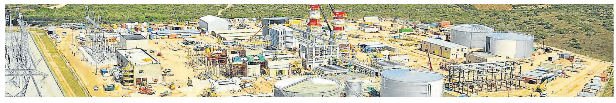
FUTURE FACILITY: The Coega Industrial Development Zone will offer a tyre testing operation from 2017