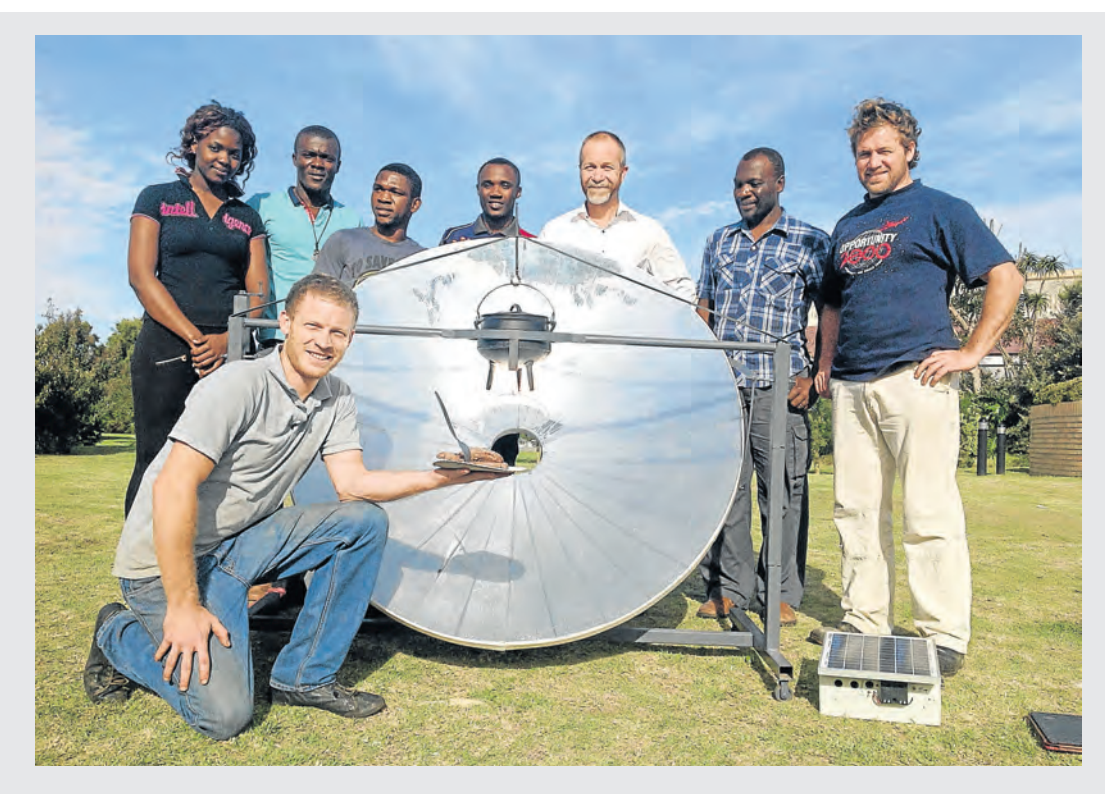
SUNNY BUSINESS: This outsized kettle dish can be adapted for various purposes, including as a giant solar cooker