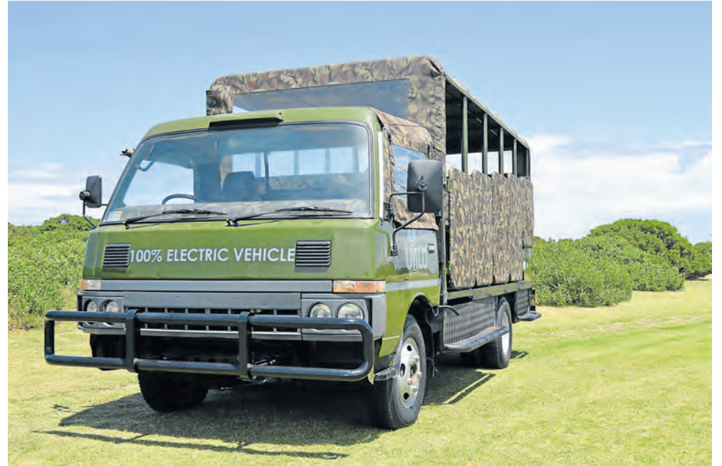
GREEN RIDE: Shamwari Game Reserve is working with the university to test an electric game vehicle as part of its holistic conservation efforts