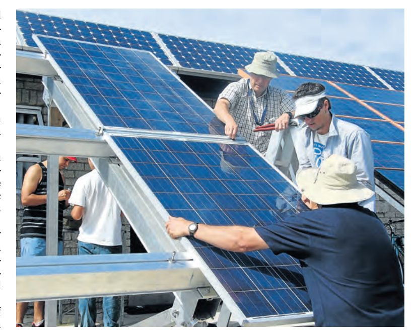
LET THE SUN SHINE: The Centre for Renewable Energy works with companies around the globe as part of its ongoing research activities

What sets it apart is that it doesn't require the darkened lab environment usually required for EL testing, which means that test-