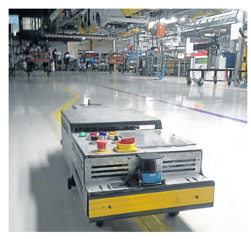
UP A GEAR: Automated guided carts are being developed to assist with transfer needs within warehouses. General Motors South Africa is working with NMMU to determine the capabilities of such carts

Another, more sophisticated AGV for use in warehouses has been developed by the university's eNtsa unit in collaboration with the Port Elizabeth-based Corporate Renaissance Group (CRG), which is one of the leading warehouse consulting companies in South Africa. The AGV is equipped with a