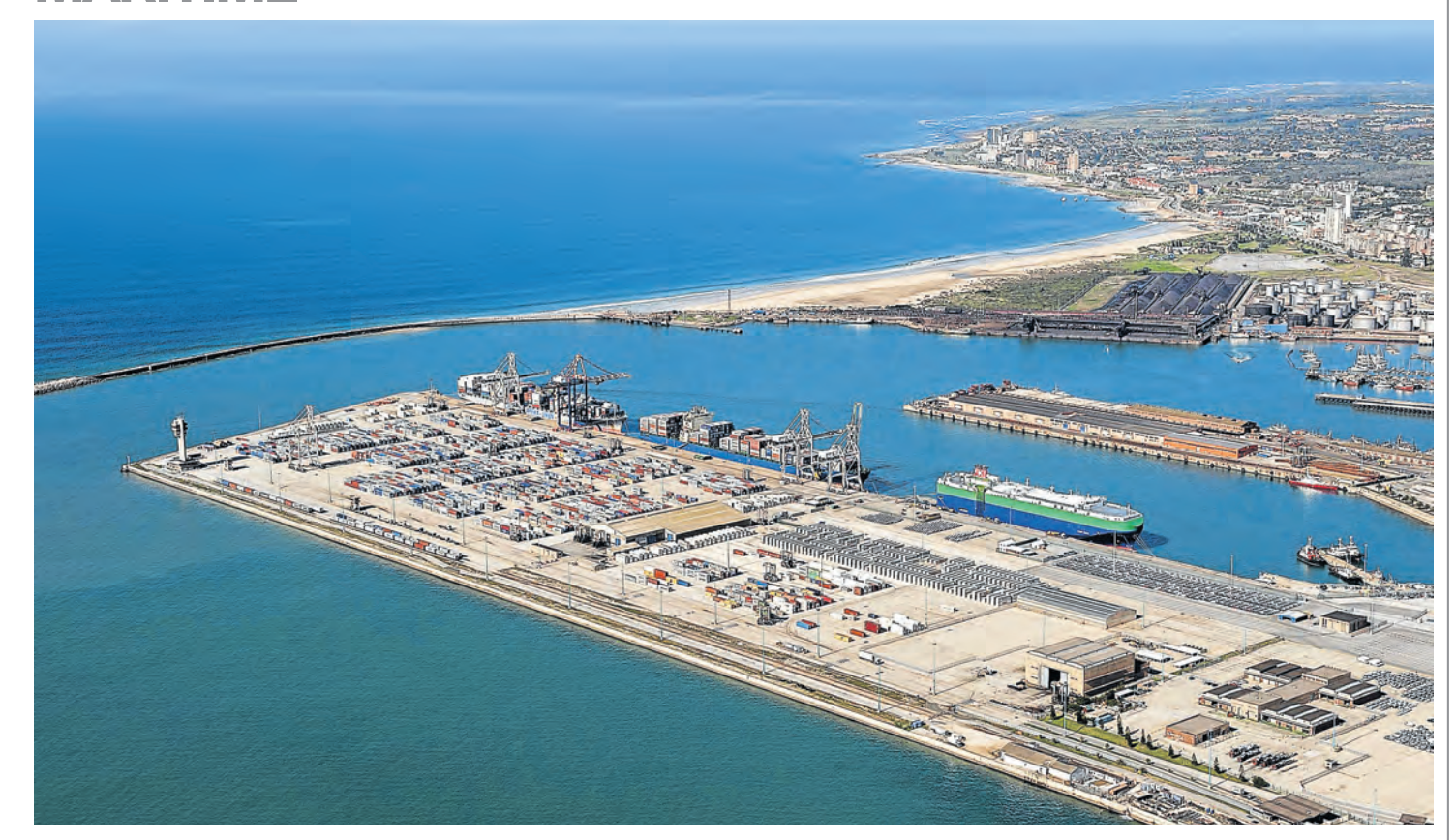
UNTAPPED POTENTIAL: With 2 500km of coastline, South Africa – and the Eastern Cape in particular – is ideally positioned to harness the benefits of a sustainable blue economy