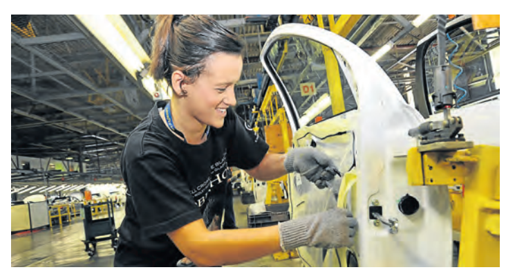
ON THE LINE: Mechatronics and other engineering students benefit from industry and university partnerships. NMMU has been successful in attracting women to the profession

SCHOOL-LEAVERS wanting to enter the motor industry as engineers are obtaining a worldclass education in the Eastern Cape