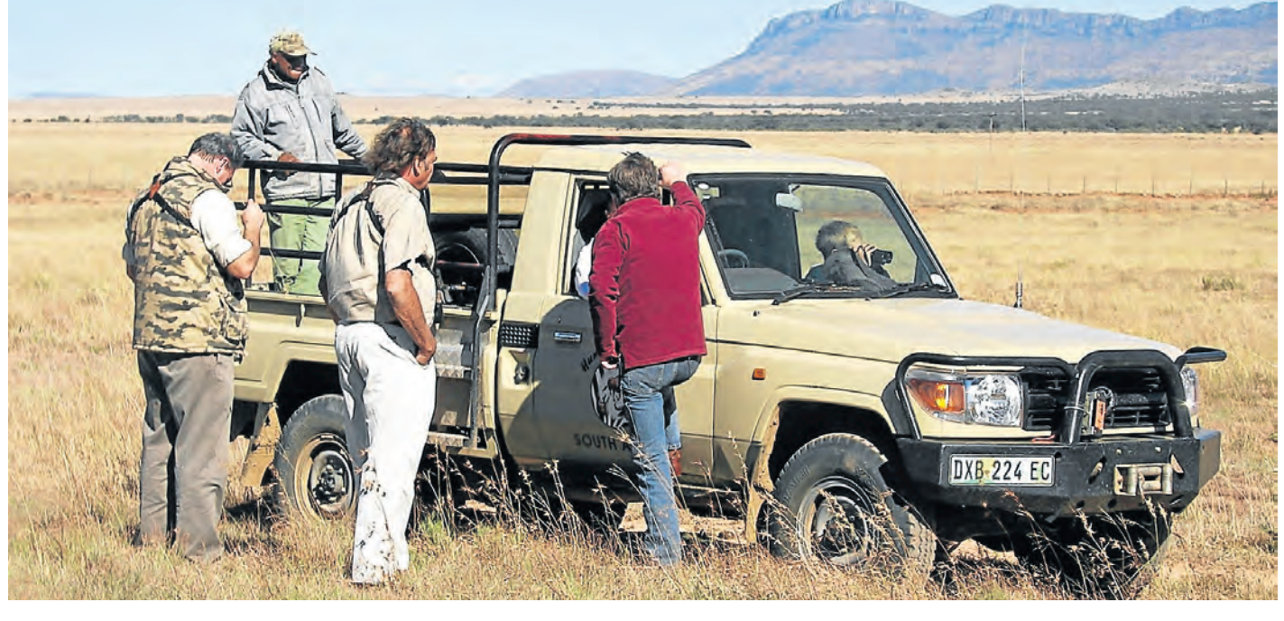
MEETING NEEDS: South Africa's game ranch industry is thriving, with the Eastern Cape a particular beneficiary of research that ensures the management of sustainable growth