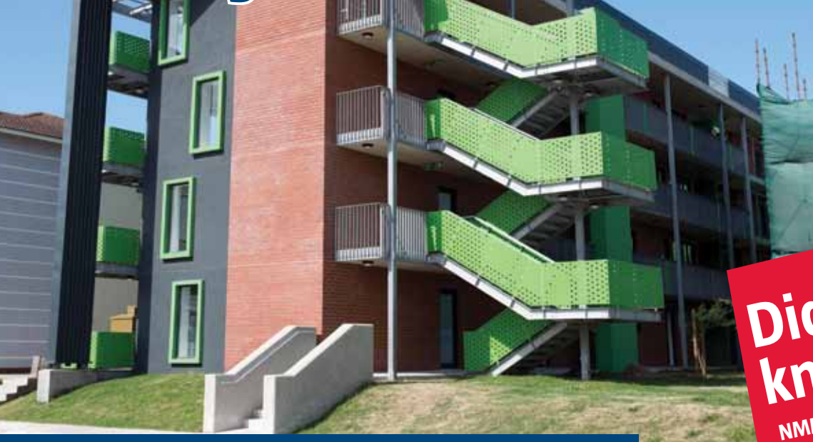
MORE ACCOMMODATION ... NMMU now offers a further 312 beds for its on-campus students.

Department of Marketing & Corporate Relations PO Box 77000 Nelson Mandela Metropolitan University Port Elizabeth • 6031 South Africa www.nmmu.ac.za info@nmmu.ac.za