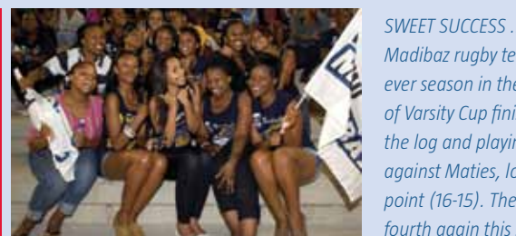
SWEET SUCCESS ... The NMMU Madibaz rugby team had their best ever season in the six-year history of Varsity Cup finishing fourth on the log and playing in the semi-final against Maties, losing by only one point (16-15). The team finished fourth again this season.

NMMU hosted the annual launch of First Things First, a national campaign for HIV testing and counselling within higher education, with Health Minister Dr Aaron Motsoaledi as keynote speaker.